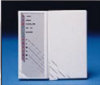
XK-108 8 Zone LED Keypad