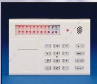
XK-716 16 Zone LED Keypad