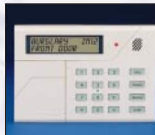
XK-7LC LCD Keypad